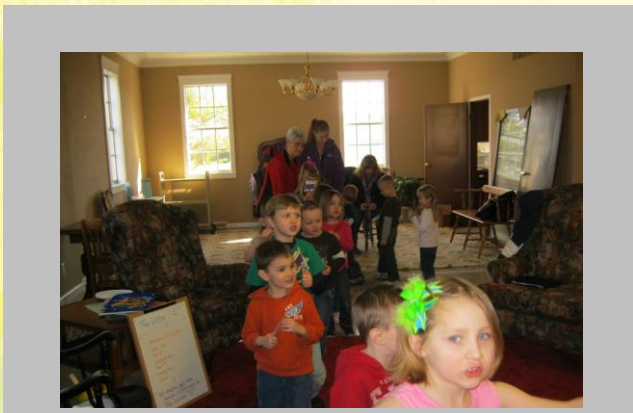
4&5 YEAR OLDS GO TO STORY TIME

Every Wednesday the 4&5 year old class go to the library for story time. They get two books read to them by the librarian, play a game, do a song and a craft that relates to the story. They all have a really good time and look forward to it every week. At the left the children are in line for the Quiet Train. This is what they do to settle themselves down and get ready for the first story. The train weaves through the library and back to the carpet.